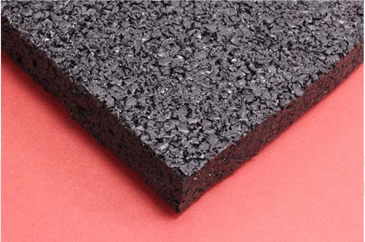
Side "A" of the product