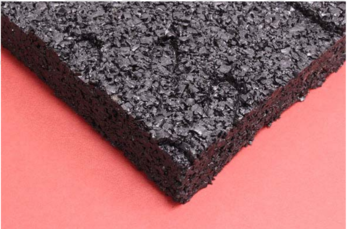
Side "B" of the product