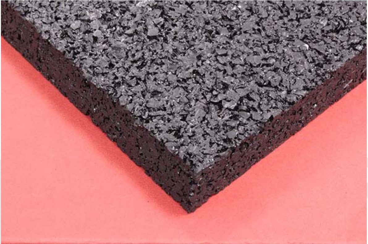
Side "A" of the product