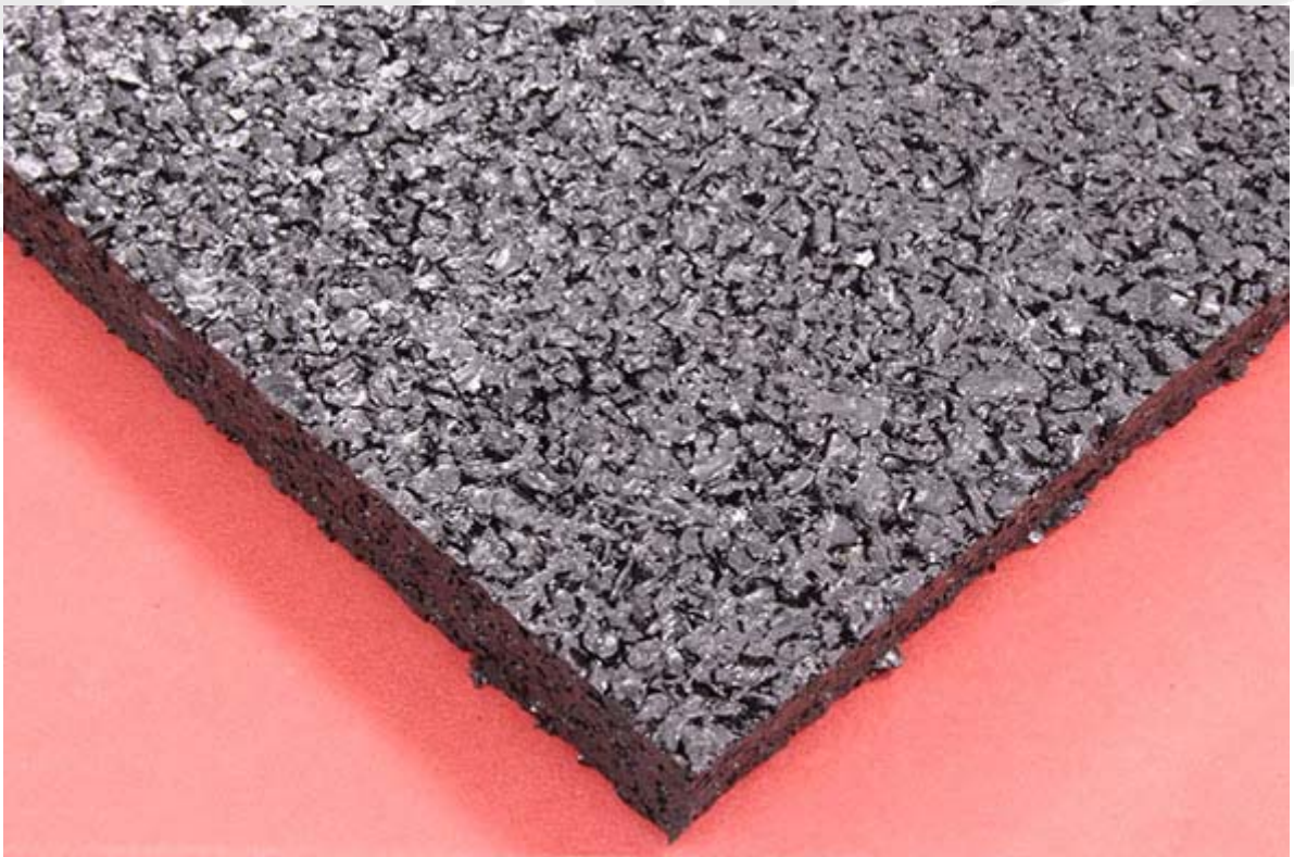
Side "B" of the product